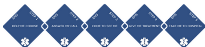
Figure 1 - Five Step Ambulance Care Pathway

WAST provides a range of services which are coordinated through Clinical Contact Centres which, receive calls for help from the public and health care professionals who need to access emergency assistance for a patient.