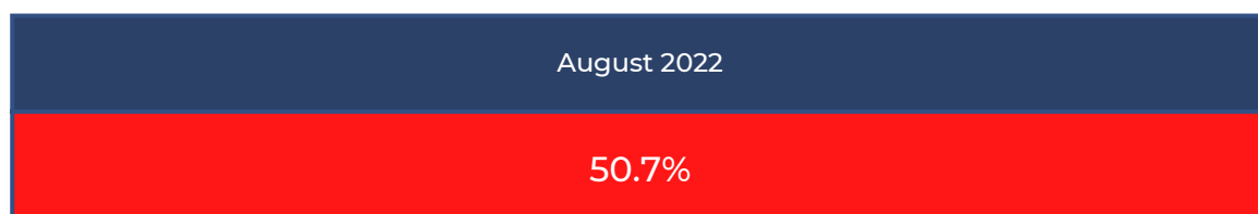
Table 3 – Monthly National RED Percentage Response Target

The Wales national target for a response arriving to RED calls in 8 minutes is 65%. At an all Wales level, this target was not met for this month.