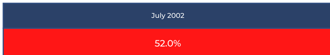
Table 3 – Monthly National RED Percentage Response Target

The Wales national target for a response arriving to RED calls in 8 minutes is 65%. At an all Wales level, this target was not met for this month.