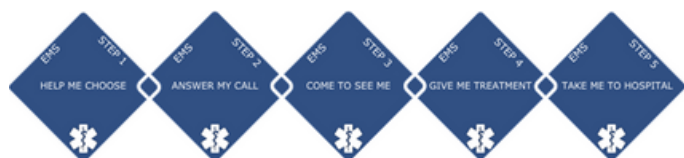
Figure 1 - Five Step Ambulance Care Pathway

WAST provides a range of services which are coordinated through Clinical Contact Centres which, receive calls for help from the public and health care professionals who need to access emergency assistance for a patient.